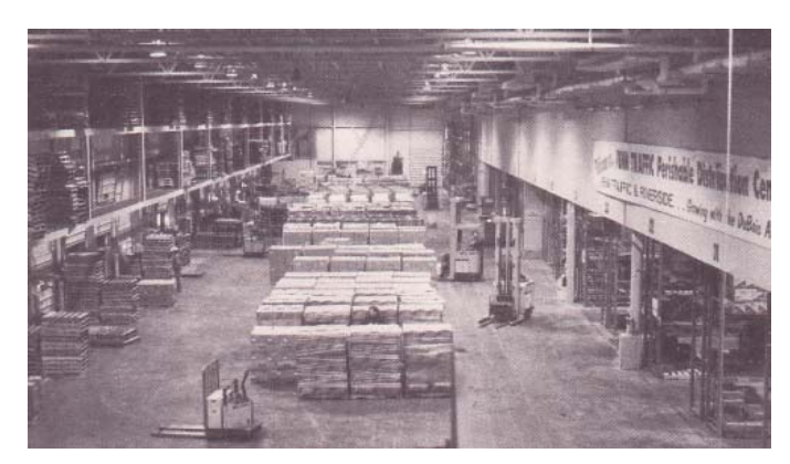
Receiving docks with 35°F. temperature help to maintain product integrity as 200 fresh produce loads are received each week.

In addition to these ripening rooms, the perishables center also