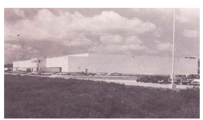
The new 142,000-sq.-ft. perishables distribution center opened by Penn Traffic Company ships 562 orders per week to 123 retail customers.

state-of-the-art banana rooms utilize Del Monte's Pressure Ripening System (PRS), which ripens the bananas without restacking the receiving pallet. Each banana room holds one truckload (approximately 960 boxes) of bananas. Once the bananas are placed in the ripening rooms, a vinyl tarp covers the pallets, forcing the air flow through the boxes. This three-day process achieves a more even ripening, while shortening the ripening process and decreasing damage from handling.