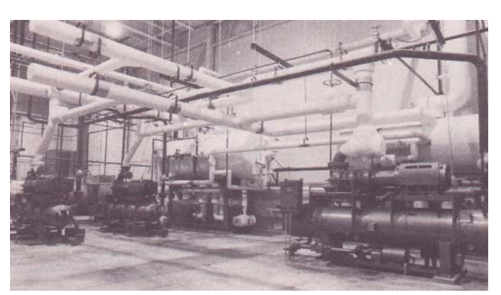
A central ammonia refrigeration system is computer controlled at the DuBois facility. There are seven temperature zones within the perishables center.